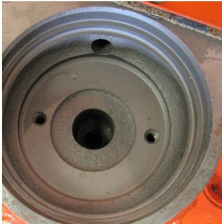
1. Pre-68 block with no spin on landing pad: